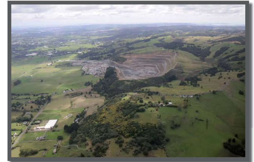
Drury quarry and Hunua foothills looking north