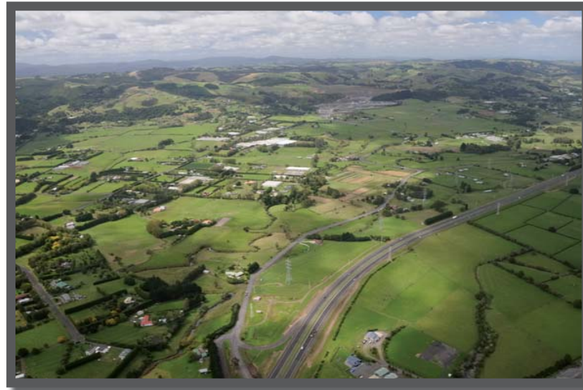
Looking south east across Drury south basin to Hunua foothills