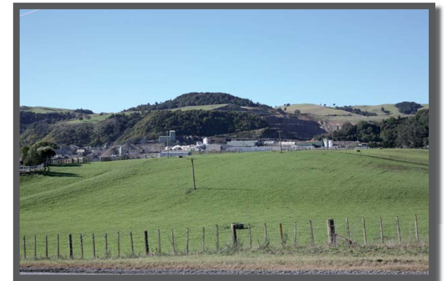
Looking east to quarry site from Drury south basin