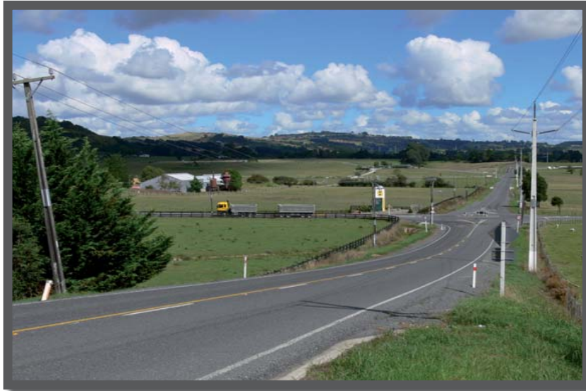
Ramarama Road looking south towards Bombay hills