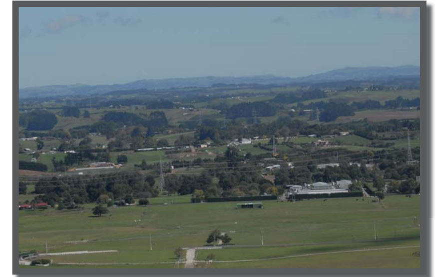
Westerly view across Drury south basin