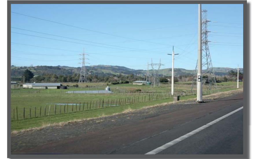
South east view from SH1 across site to Hunia foothills