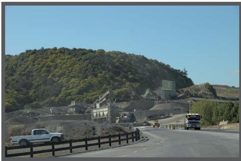
Drury quarry access road